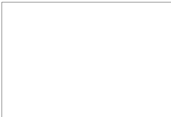
Figure 1. Example of caption. It is set in Roman so that mathematics (always set in Roman: B \sin A = A \sin B ) may be included without an ugly clash.

216 217 218 219 220 221 222 223 224 225 226 227 228